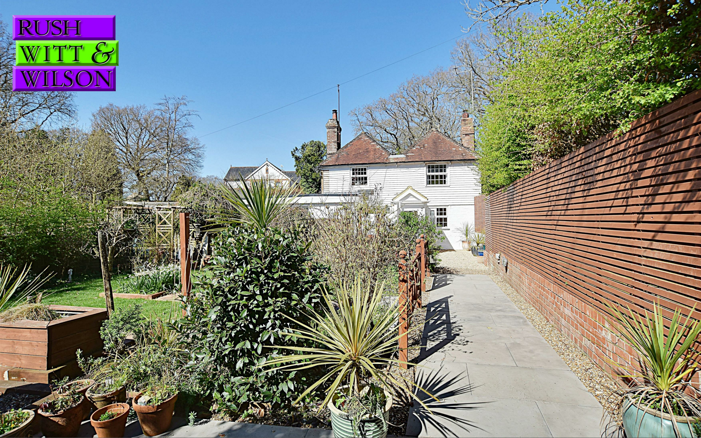
1 Highcroft Cottages Whydown Road, Bexhill-On-Sea, East Sussex TN39 4RB £415,000